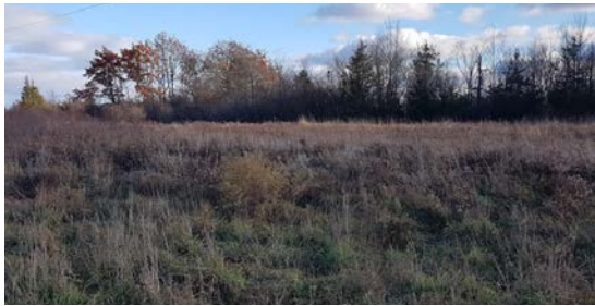
Open fields within the park are separated by existing hedgerows of mature trees.