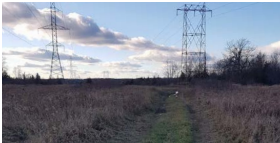
Existing condition of the hydro corridor to the north of the park.