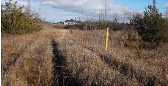
A future path along the gas line will connect the park to the future north/south trail along Collins Creek.