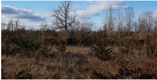
Where possible, vegetation within the park will be preserved.