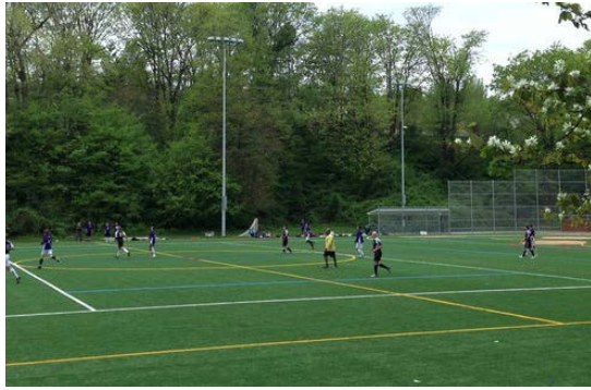
Rectangular Play Field