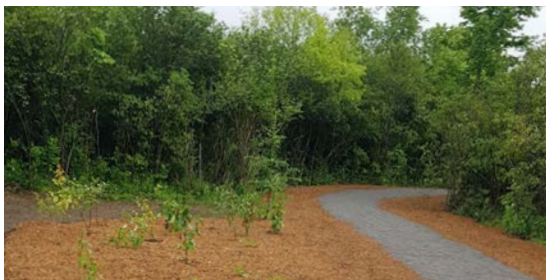
Character of proposed trails in the Collins Creek Open Space. Surfacing to be low impact, compacted granular.