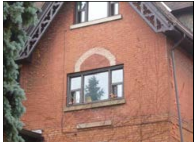
Photo 5: Changes to original window openings, as in the example above is not permitted.