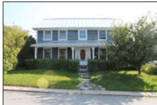
Photos 12 & 13: Examples of new construction that is the same scale and character of the District.