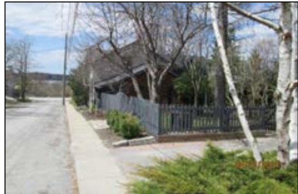
Photo 19: Example of streetscape / sidewalk combination within the District.