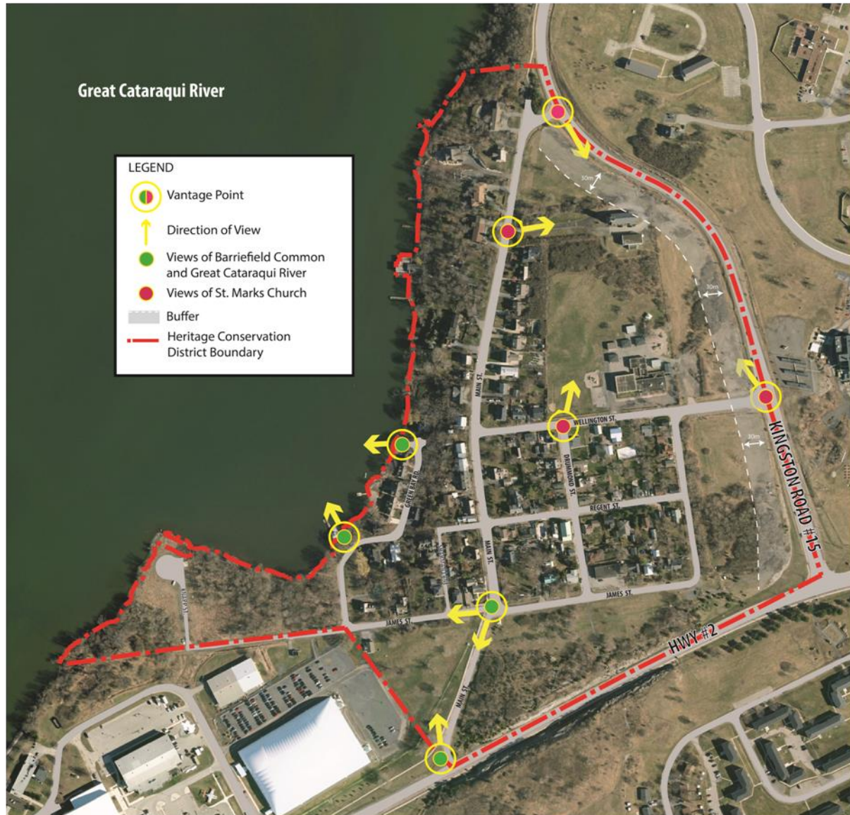
Figure 2: Significant historic views to be retained.

The following policies and guidelines apply to the retention of significant historic views within the District: