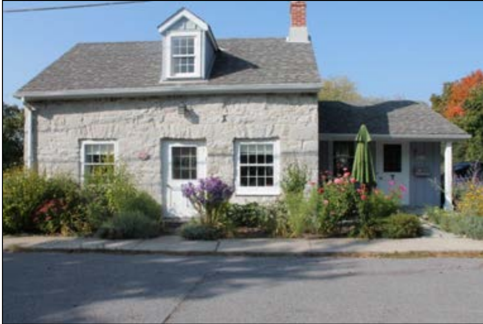
Photo 11: Example of a contemporary addition that is set back from the original building, located to the side, and compatible with the historic built form.