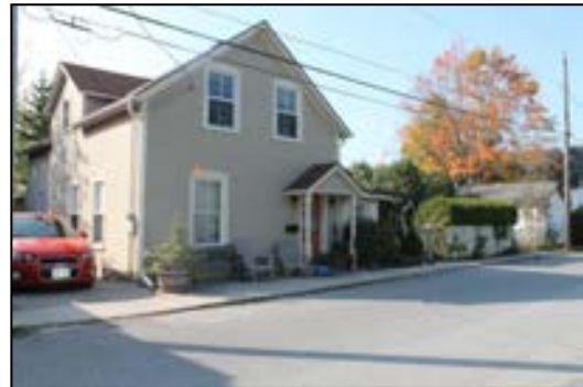
Photos 3 & 4: Original roof shape and configurations shall be retained, as in the above examples.