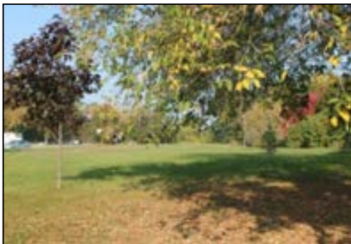
Photos 21-23: Various landscape features within the Barriefield Rock Garden

The City of Kingston may investigate the addition of other parks and open space areas in order to conserve the cultural heritage value, particularly the rural atmosphere, of the District and provide further recreational green/park space. See Section 4.5.4 with respect to providing parkland on vacant lands.