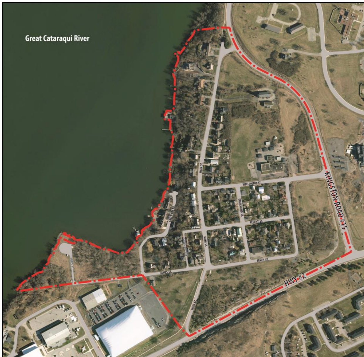
Figure 1: Village of Barriefield HCD boundary (shown in red).

The Village of Barriefield is the oldest Heritage Conservation District (HCD) in Ontario, having been designated under Part V of the Ontario Heritage Act by the former Township of Pittsburgh in 1979 and approved by the Ontario Municipal Board in 1981. A review of the HCD Plan was completed in 1992, with a new document prepared at that time. The 1992 HCD Plan has been utilized for the past 24 years to conserve the heritage value and guide development within Barriefield. The boundary of the Barriefield Heritage Conservation District (HCD) is shown on the map below: