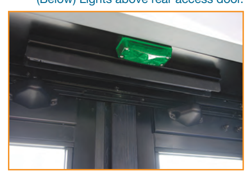
(Right) High-colour contrasted hand rails. (Below) Lights above rear access door.

related to a person's disability. In some circumstances, we may ask for a letter from a physician or nurse confirming that the animal is required for reasons relating to a disability.