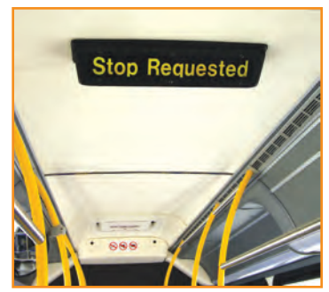
High-contrast visual on-board stop request sign.

For more details on the accessible features of our bus fleet that have been implemented to date as set out by the AODA Standard, please refer to page 18, Appendix A – "Accessible Features of Bus Fleet". Also indicated are the Standards that we are working towards achieving on or before the required dates.