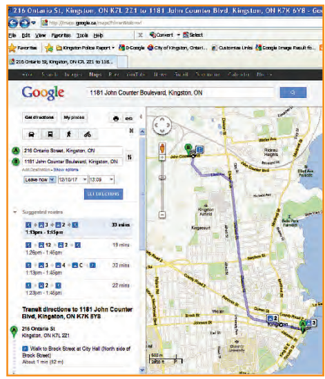
View of trip plans from City of Kingston website (left) and Google Maps (right).