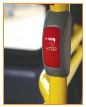
Stop request control operable with one hand.

Kingston Transit's Courtesy Seating Policy is intended to make the City's buses safe and accessible to all passengers.