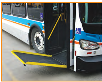
Bus ramp being lowered.

Kingston Transit provides conventional bus service within the urban area of the city of Kingston and, under contract, to the neighbouring community of Amherstview. We recognize that public transit is an important link to work, social events and activities for our riders and accessibility enhancements improve the usability of the transit system for all riders. Kingston Transit is committed to providing accessible service for customers with disabilities,