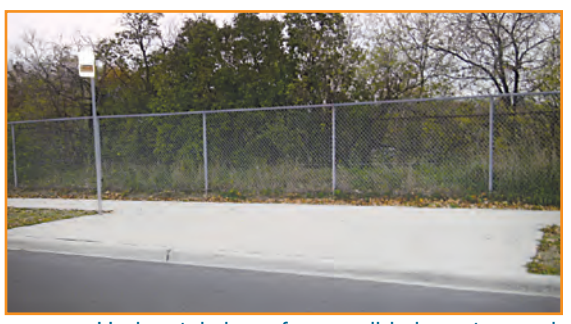
Horizontal view of accessible bus stop pad.

Since 2010, we have been building new and retrofitting existing bus stops to these design guidelines. As at March 31, 2012, we have enhanced over 45 bus stops and another 23 will be upgraded by the end of December 2012. The location of bus stops to be upgraded in the future is based upon the routes and bus stops located on the proposed express