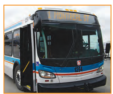
Electronic route sign on front and side of bus.