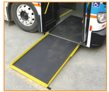
Ramp with contrasting colour strips and slip-resistant surface.

Bus operators will secure wheelchairs and scooters. It is the responsibility of wheelchair riders to ensure their devices are in the locked position. Bus operators will provide assistance, upon request, with boarding and deboarding, provided