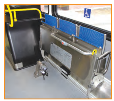
Request stop controls within reach of mobility aid space.

the bus operator deems the assistance can be performed in a manner that is safe for both the bus operator and the passenger.