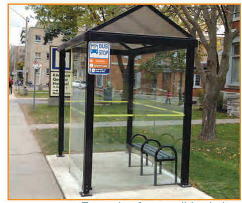
Example of accessible shelter, dimensions 1,524 mm x 2,348 mm (5 ft x8 ft) with minimum entrance of 1,117 mm (44 in).

Under the existing contractual agreement, the third party company installs bus shelters that are 1,219 millimetres x 2,438 millimetres (48 inches x 96 inches) with an opening of 1,041 millimetres (41 inches). When the existing agreement expires in December 2014, we will negotiate a new agreement that requires shelters meeting accessibility standards (see (ii) below) be installed in the future. In the interim we will request that the current supplier install any new shelters to the specifications in (ii) below, subject to agreement by the supplier.