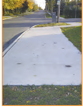
Long view of accessible bus stop pad.