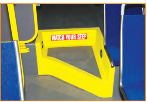
(Left) Close up of wheelchair seating area. (Right) Caution signs and high-colour contrasted slip-resistant steps leading to upper deck of bus.