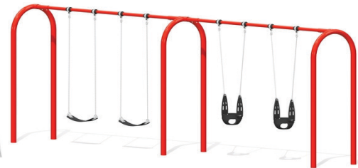
Double bay swing with accessible seat