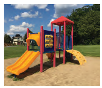
Existing Junior Play Structure