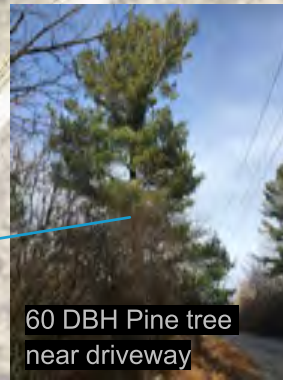
60 DBH Pine tree near driveway