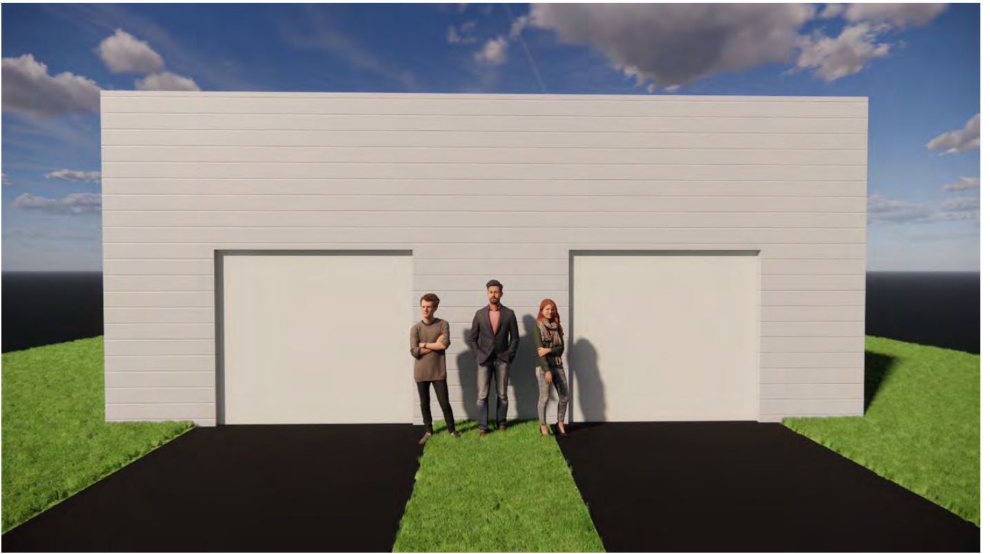
Front View of Proposed Boat House Building