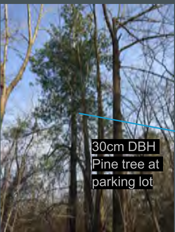
30cm DBH Pine tree at parking lot