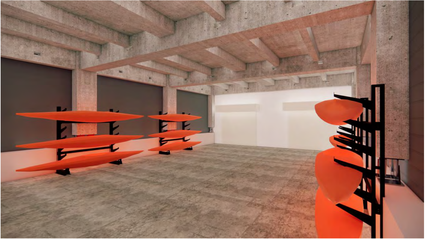
Inside View of Proposed Boat House Building