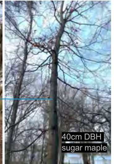
40cm DBH sugar maple