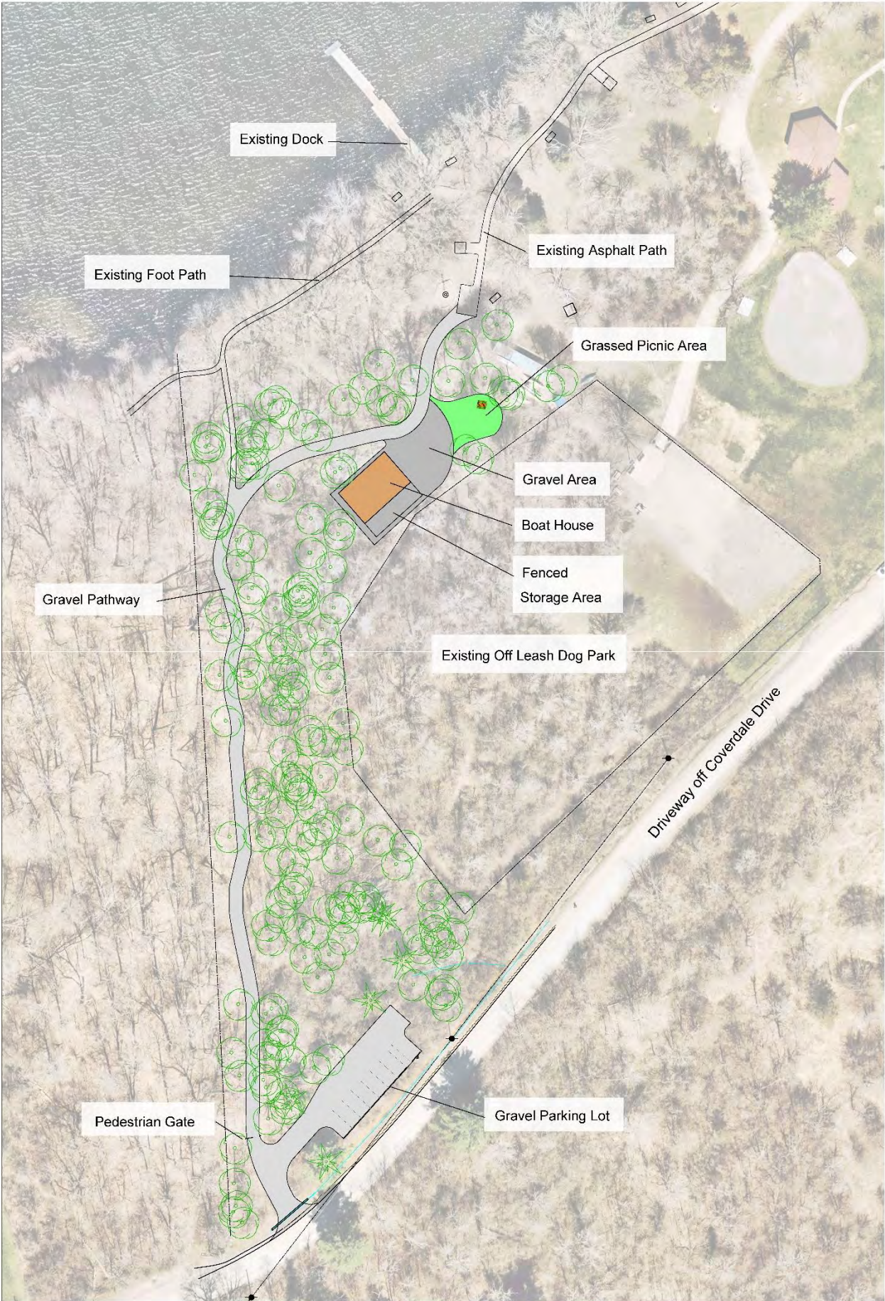
Rotary Park Improvement Layout Plan