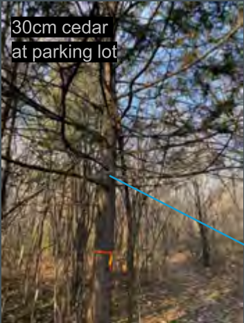
30cm cedar at parking lot