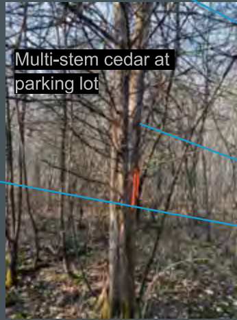
Multi-stem cedar at parking lot