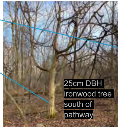
25cm DBH ironwood tree south of pathway