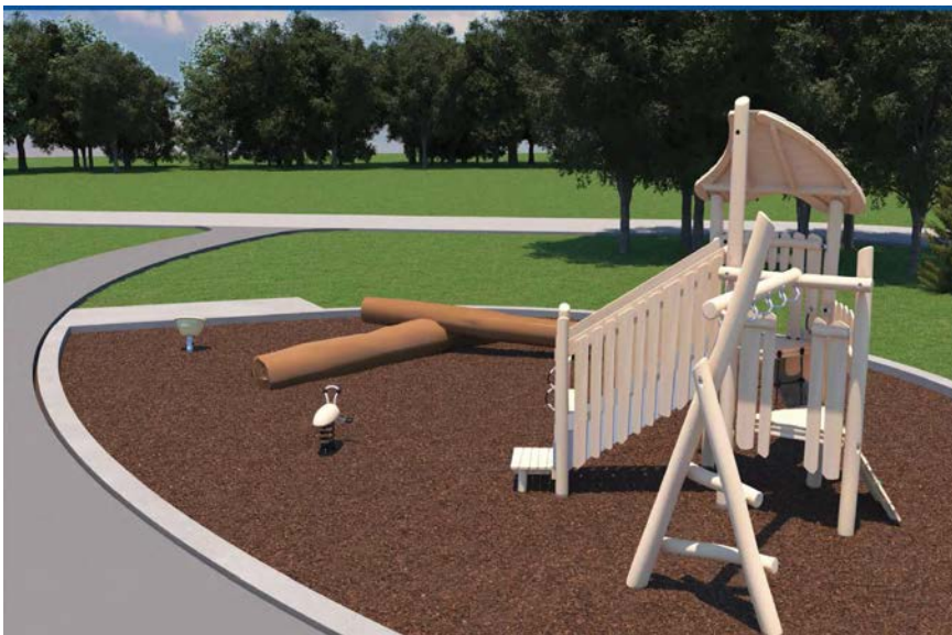
Option 1 Playground equipment for Max Crescent Park.