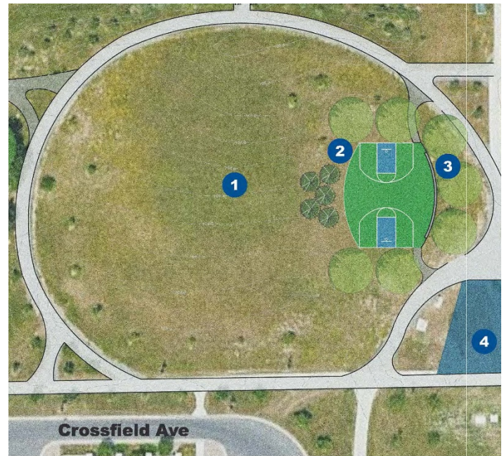
Basketball Option #2