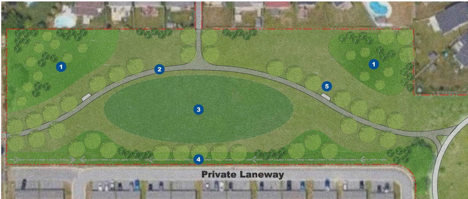
Bert Meunier Common - Open Space Option 2.