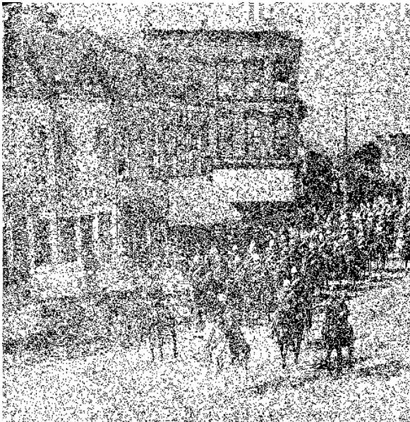
58. Former Garrett buildings at the corner of Brock Street and King Street East. ( Kingston Heritage , page 204)

This building has historical or associative value due to its association with the Canadian Bank of Commerce. The bank was founded on May 15, 1867, in Toronto, with the Honourable William McMaster as the principal founder and its first president. McMaster founded the bank to serve as competition for the Bank of Montreal; he was concerned about Montreal's economic influence in Upper Canada. By 1874, it was the largest bank headquartered in Ontario. The bank merged with the Imperial Bank of Canada on June 1, 1961 to form the Canadian Imperial Bank of Commerce.