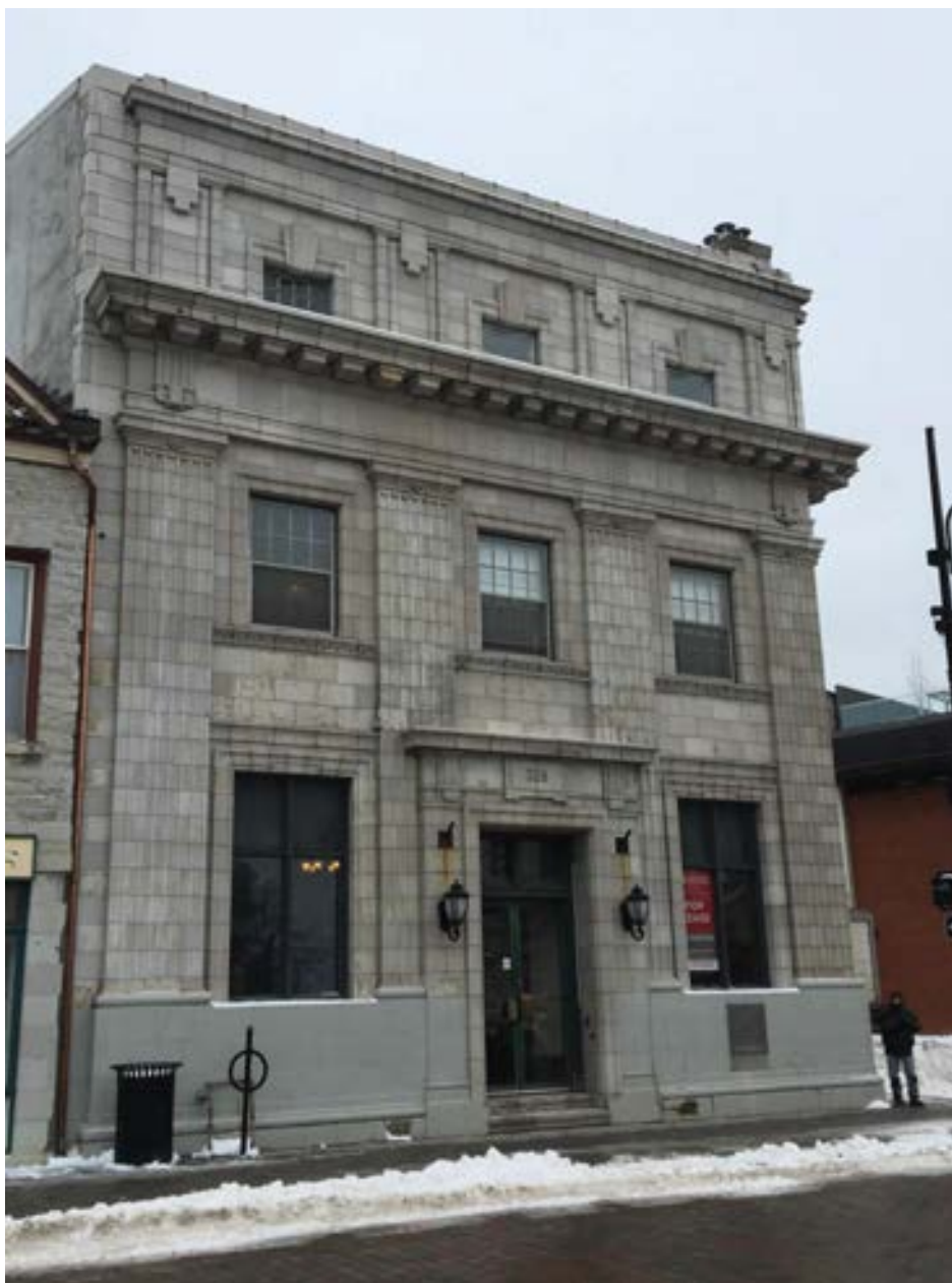
East Elevation (King Street East)