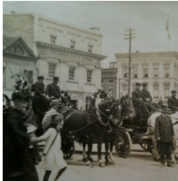
59. Former Canadian Bank of Commerce building in background.