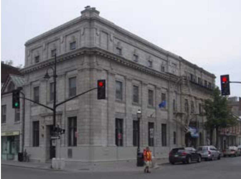
Former Canadian Bank of Commerce building