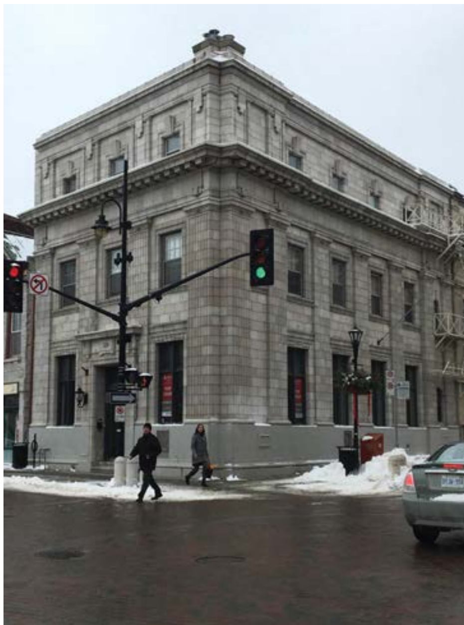
North Elevation (Brock Street)