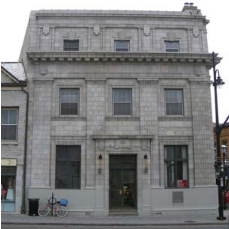
60. Primary facade, 2012. (ERA Architects Inc.)