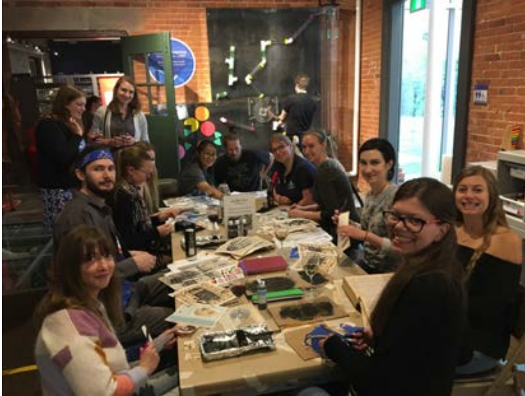
Figure 5 Young adults at Leo After Hours at the PumpHouse