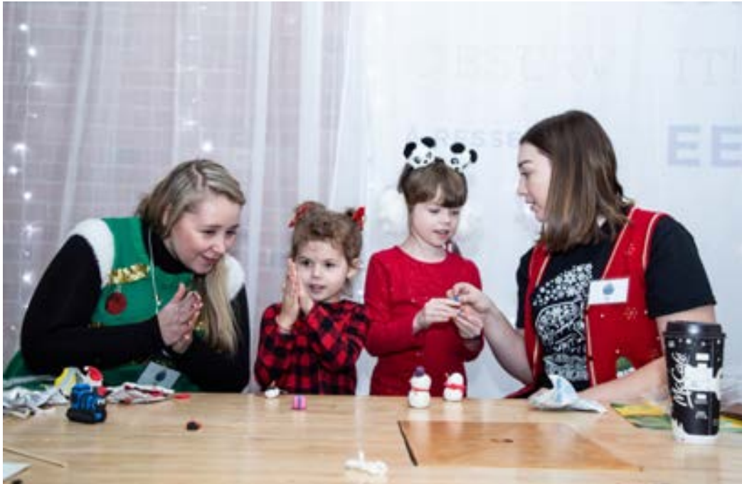
Figure 4 Staff crafting with young visitors at All Aboard for the Holidays at the PumpHouse

The PumpHouse's new All Aboard school program was fully booked by two groups (83 visitors total). The regular weekend event brought in 858 visitors and 11 bags of toy donations were collected for the local Toy Drive. The sensory-friendly morning had 46 visitors, who pre-registered for this closed event through Autism Ontario. Visitors greatly enjoyed the opportunity to participate in holiday festivities at a designated quieter time. All Aboard After Hours, a 19+ event, took place on December 13 th and featured live music, gift-making stations and a gingerbread house building competition. The event brought in 35 visitors, many of whom were first-time visitors to the museum.