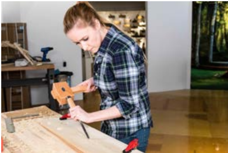
Figure 6 Chiseling in the workshop at the MacLachlan Woodworking Museum

six informational woodworking panels. Placed throughout the Workshop, the panels assist visitors in identifying common woodworking tools used within the Workshop, and explain their identifying features and specific use. The panels address themes such as fastener types, types of blade tools and blade sharpening, wood types and wood characteristics. A panel that provides workshop safety information and rules for visitors was also included in this installation.