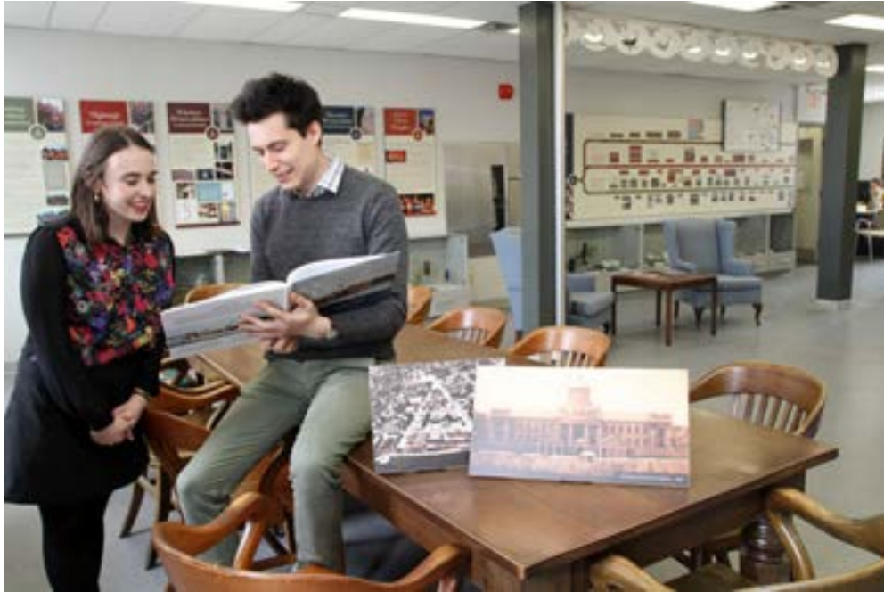
Figure 2 Heritage Resources are available for public use in the Heritage Resource Centre at Kingston City Hall

grow and the Virtual 3D Tour of City Hall continues to serve as an effective way to expand the City Hall experience and to provide access to sections of the National Historic Site that are not readily accessible to the public.