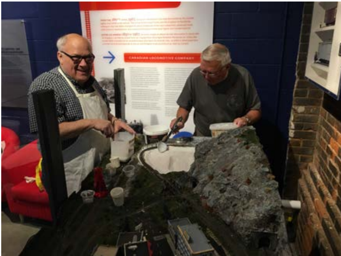
Figure 1 Two model train society volunteers working on a new layout in the Train Room at the PumpHouse

The PumpHouse Model Railway Society volunteer's maintain and operate both new and refurbished model train equipment as part of the Museum's popular train exhibit. Most of the model trains and railways found at the museum are rare collector's items that are carefully maintained by these committed volunteers. They also support special events and programming days at the site, including the annual All Aboard of the Holidays event in December.