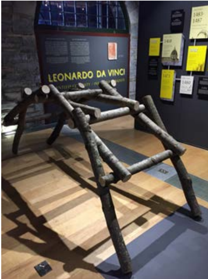
Figure 3 Model bridge from the Leonardo da Vinci exhibition at the PumpHouse

2018 several of these models were transferred to Queen's University where they are to be exhibited for years to come.