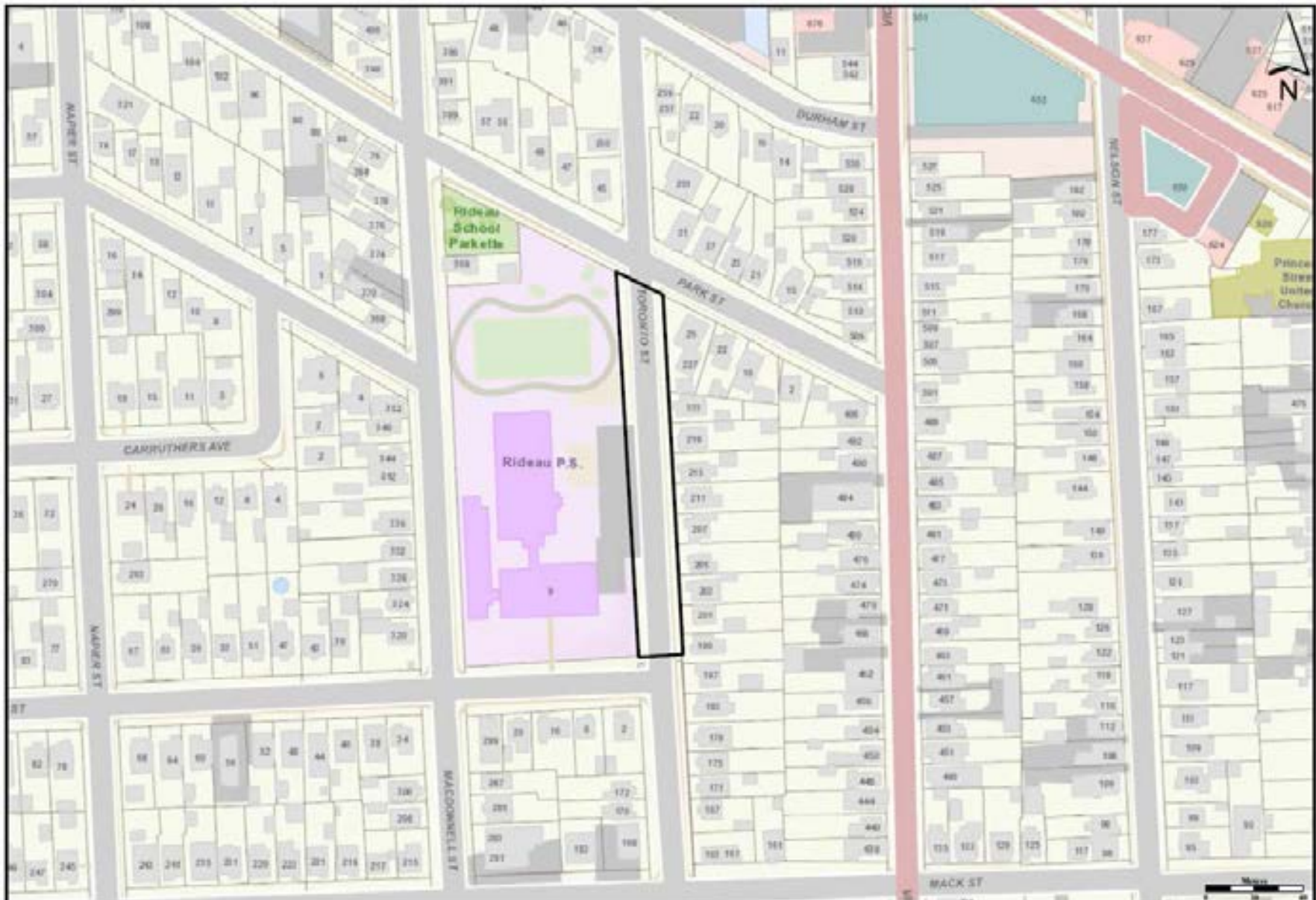
Location Map Toronto St