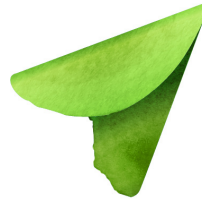
Farleigh Seaton, |KFL&A Public Health (alternate)