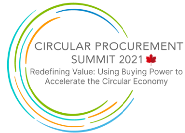
Circular Procurement Summit: Day One - Virtual