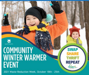
Municipality of East Hants Community Winter Clothing Swap Event