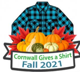
City of Cornwall Give A Shirt Clothing Collection