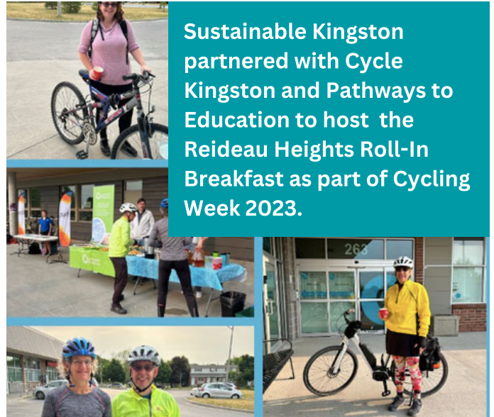
Sustainable Kingston partnered with Cycle Kingston and Pathways to Education to host the Reideau Heights Roll-In Breakfast as part of Cycling Week 2023.