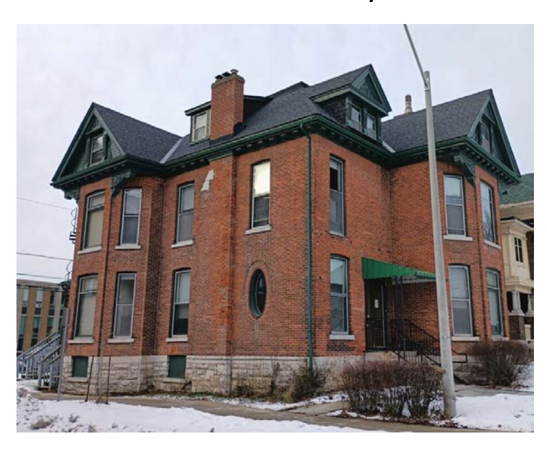
Cappon House – 26 Barrie