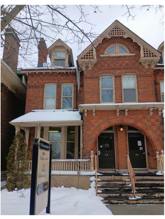
Strange House – 34 Barrie