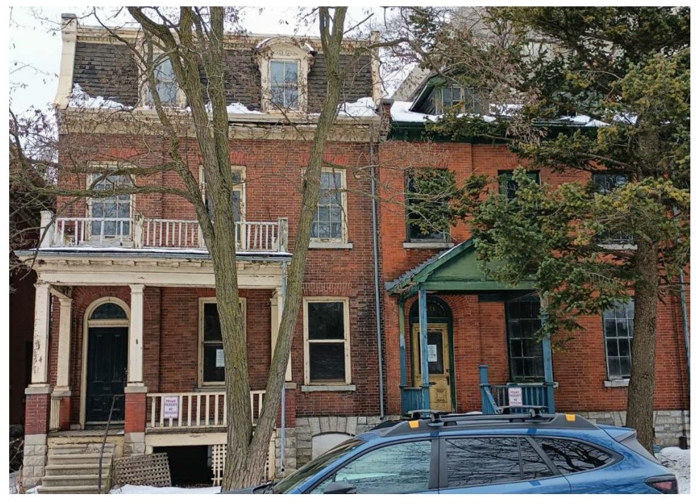
Doran & Robinson Houses – 64-66 Barrie St