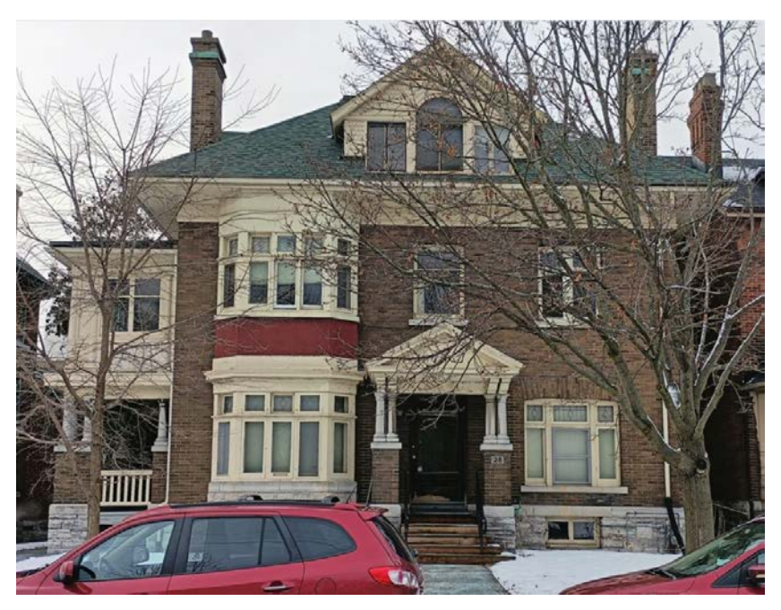
Bibby House – 28 Barrie