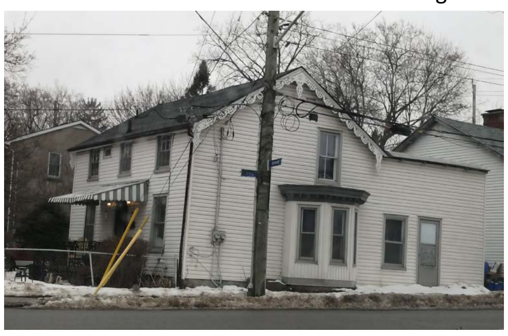
From Yonge St - 2024