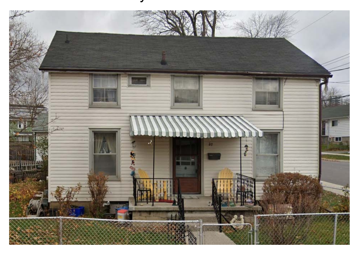
Google - 2020