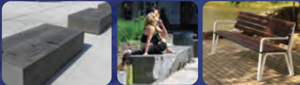
Free-standing Wood or Stone Seating, Park Benches and Seatwalls