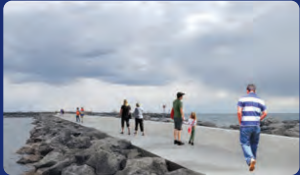
Artist Rendering of Promenade with Low Wall on Lake Side