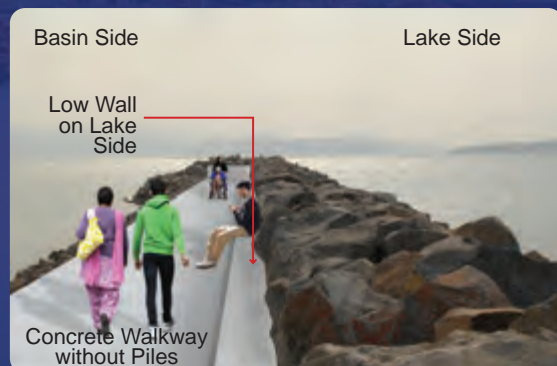
Artist Rendering of Concrete Deck Without Piles

www.cityofkingston.ca/city-hall/projects-construction/confederation-basin-promenade