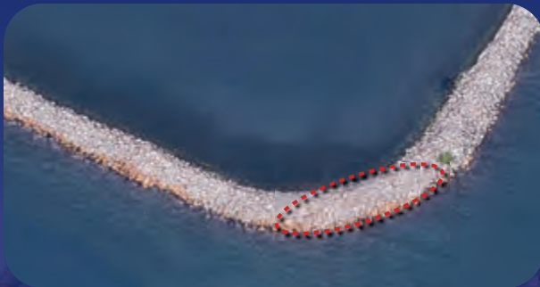
Lookout Area at Bend