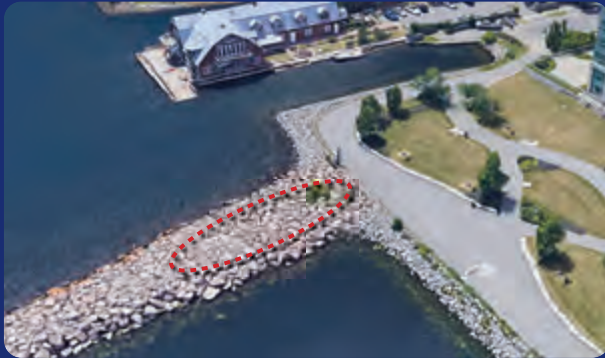
Walkway Transition Area to Battery Park