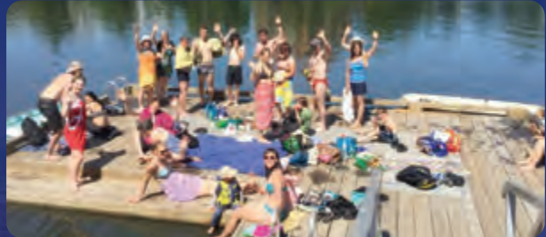
Floating Platform with Access to Promenade