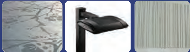
Special Paving, Pathway Lighting and Wall Treatment

www.cityofkingston.ca/city-hall/projects-construction/confederation-basin-promenade