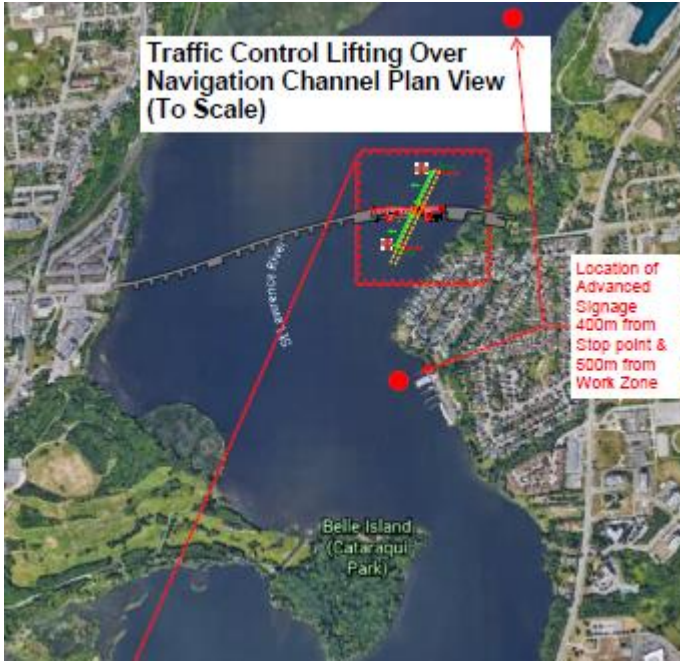
Image of work over navigation channel and the traffic control measures (red is spotter boats)