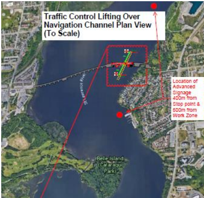
Image of work over navigation channel and the traffic control measures (red is spotter boats)