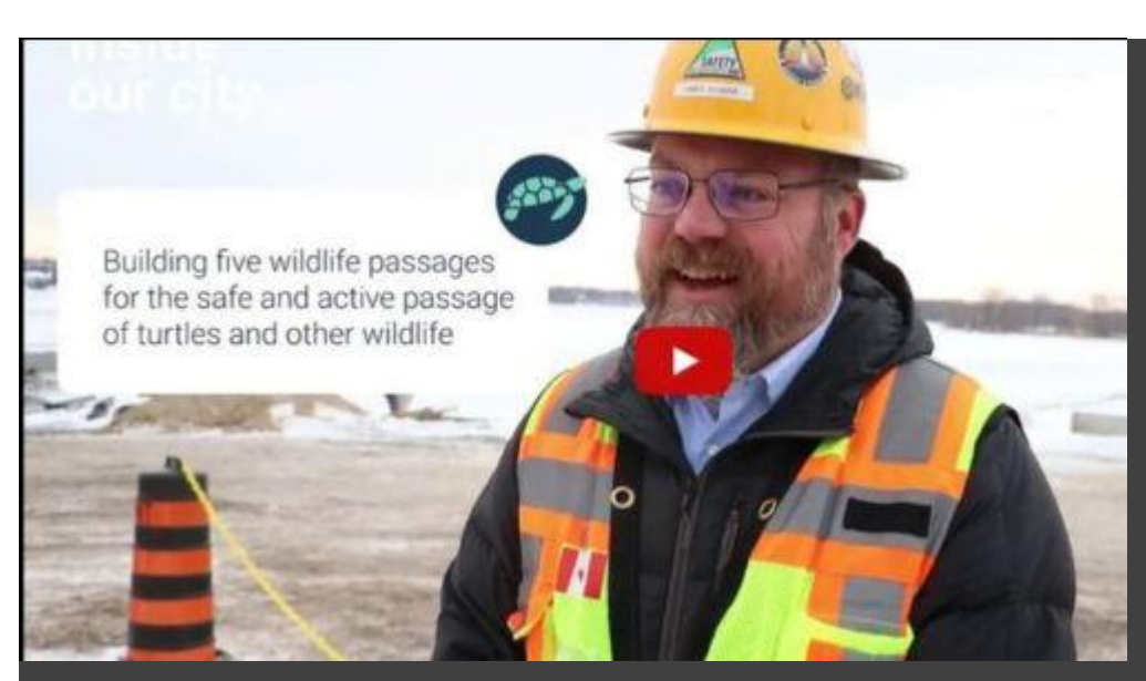
Project Manager for the construction contractor, Kiewit, gives us an upclose look at some of the work happening on the west shore.

Work continues on building the east shore noise fence. It is anticipated drilling will begin the second week of February. Drilling will have some noise associated with the work. Following post installation, crews will start putting up the noise fence at the back of the properties along Gore Road and along a small portion of Point St. Mark Drive. Thank you for your continued patience as this noise fence gets installed. There may also be temporary sidewalk disruptions but onsite staff will be able to direct you as necessary.